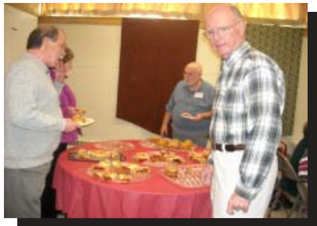
Everyone enjoyed a continental breakfast