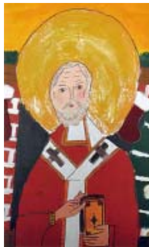
by Zoe, age 10